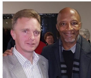
"No silent night"