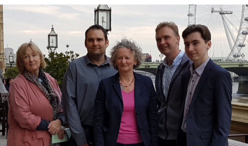
Baroness Jones took our plea to Lords